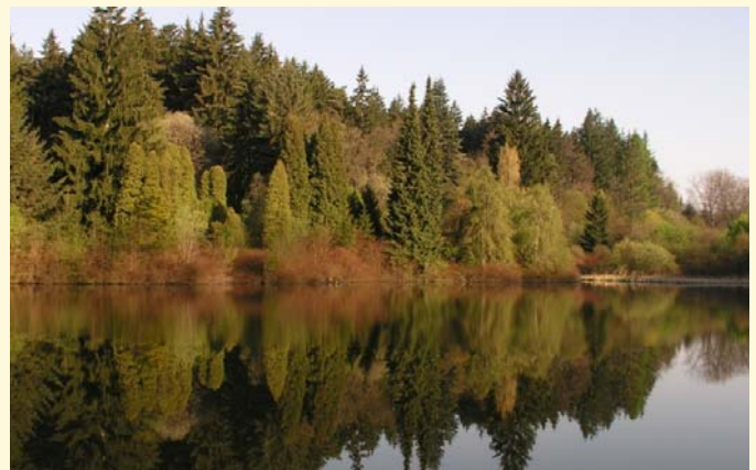
FSC certified Forest, Croatia, 2007. Milan Reska

Another new feature developed in 2007 in FSC's accreditation program is the publication of summaries of ASI surveillance audits. These are available on ASI's website at www.accreditation-services.com , increasing transparency of the accreditation process.