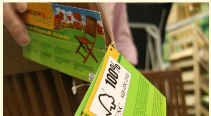
FSC certified garden chair carrying the FSC logo, 2007.

The new company will strengthen ties between FSC and certificate holders by establishing a direct relationship for trademark licensing, and will also deliver a greatly expanded set of market development services. FSC will work in conjunction with its strong system of National Initiatives, certification bodies and partner organizations who share FSC's goals.