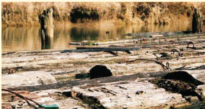
Reclaimed boomsticks, Oregon, U.S. Columbia Riverwood

The Oregon based company acquired over 1 million board feet of floating boomsticks. Over 50 years ago, boomsticks were selected from some of the highest quality logs in order to tow huge log rafts up and down powerful rivers. For decades the river has been covering all but the tops of these logs, preserving the wood.