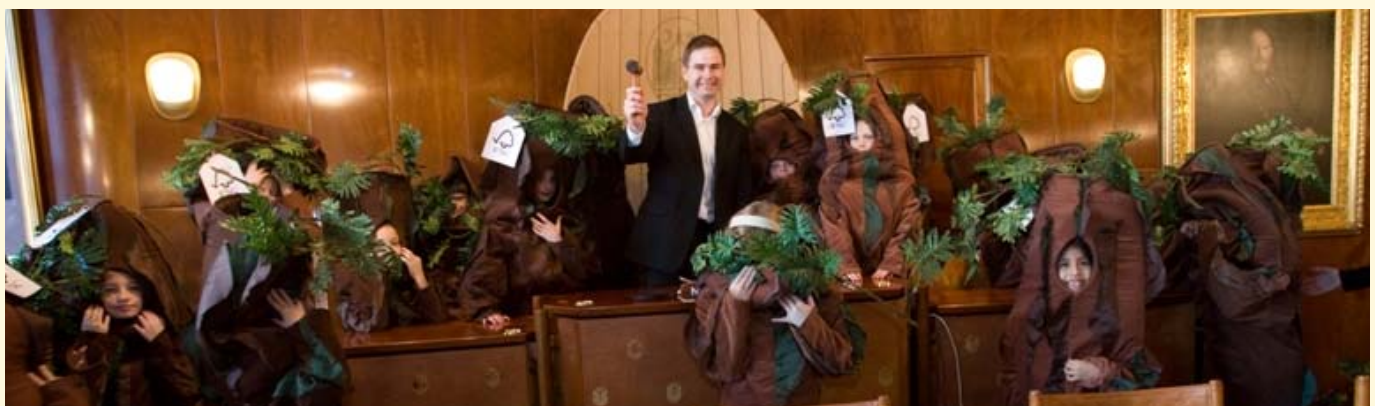
Mayor presented with FSC certified Hammer, Denmark. FSC Denmark

Much of this growth can be attributed to the 'Strike a blow for FSC' campaign carried out in 2007. FSC Denmark visited a third of the municipalities in the country to inform its members about the benefits of FSC and responsible procurement. Mayors, purchasers, politicians and employees were presented with FSC certified hammers and toolkits containing a variety of FSC products and information.