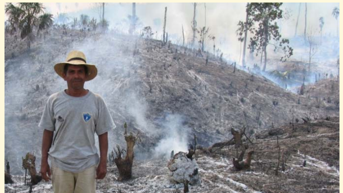
Laguna del Tigre National Park under strict protection - logging is prohibited. Slash-and-burn farmers and illegal loggers already destroyed about half of the park's forests.

Besides responsible forest management as defined by FSC standards, the study identifies a number of other enabling circumstances leading to the successful maintenance of forest cover in the FSC concession area. Continued donor support and the activities of numerous government and non-government organisations promoting environmental awareness, community vigilance programs, and responsible economic activities have been the most important.