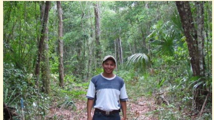
FSC certified forest deep within the Maya Biosphere Reserve. The Carmelita community managing the land harvest less than 2% of the forest a year. This access road was created two years ago - it demonstrates low impact logging practices.

Some environmentalists called for a complete logging ban in the entire reserve. The government classified about 40% of land as protected and logging prohibited. The remaining 60% under forest management were required to earn FSC certification.